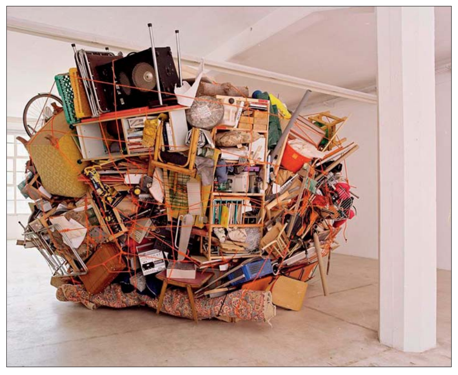
400 \times 500 \times 500 cm

9. Claire Healy and Sean Cordeiro, Deceased Estate , mixed media made up of left-over items from artists' warehouse, 2004