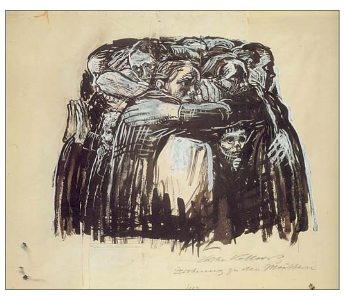
45 \times 58.8 cm

6. Viktor Koen, Damsel No. 15 , from the series Damsels in Armor , digitally manipulated archival print on canvas, 2002