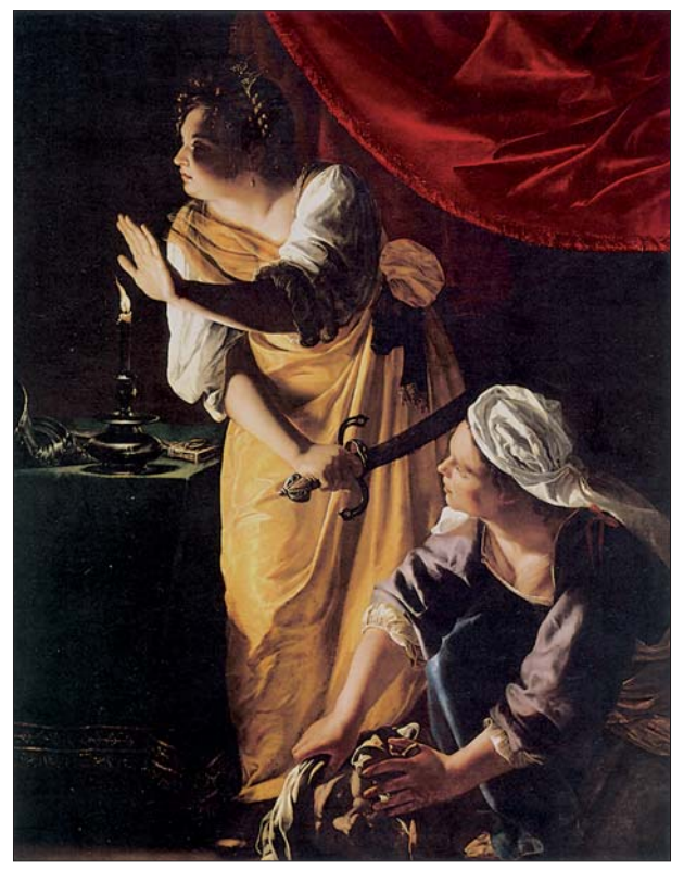
182 \times 142.2 \text{ cm}

Please remove from the centre of this book during reading time.