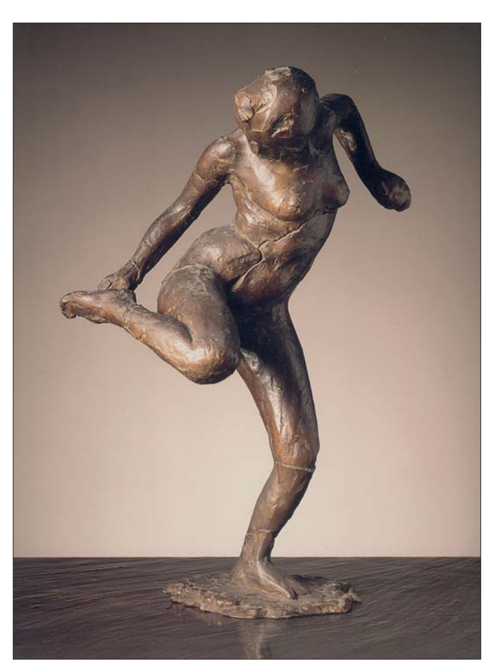
49 \times 33.5 \times 22.5 cm