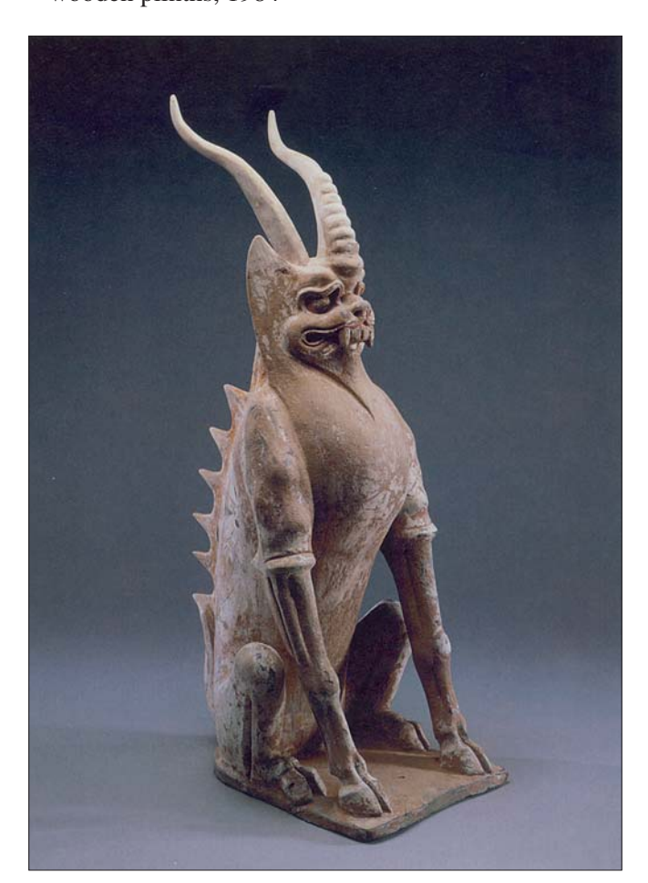
74 cm high

3. Giulio Paolini, L'altra figura [The Other Figure] , plaster, wooden plinths, 1984