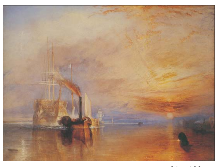
91 \times 122 \text{ cm}