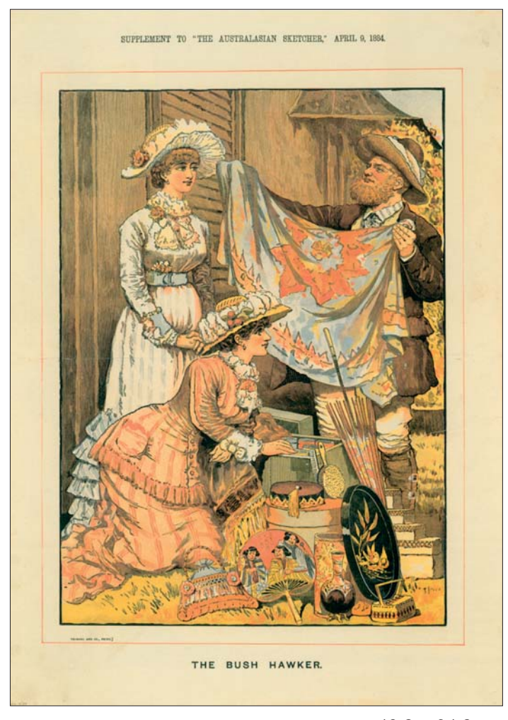
40.8 \times 24.8 \text{ cm}

5. Anonymous artist, Earth Spirit , earthenware with coldpainted pigments, Tang Dynasty, 7th century BCE