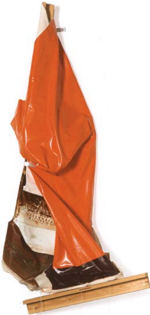
180 × 75 × 60 cm Artwork 1: Angela de la Cruz, Clutter Bag (Orange II) , oil on canvas, wood, 2004