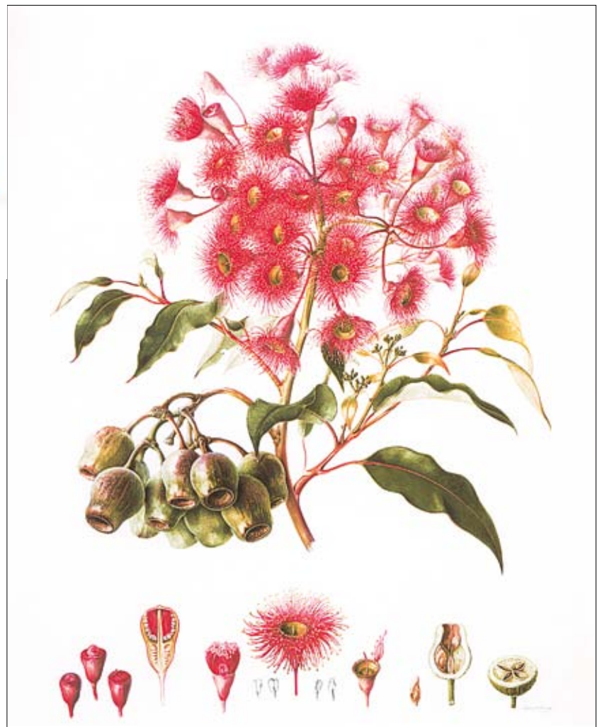
53 × 39 cm Artwork 2: Jenny Phillips, Corymbia ficifolia (red flowering gum), watercolour on paper, 1998