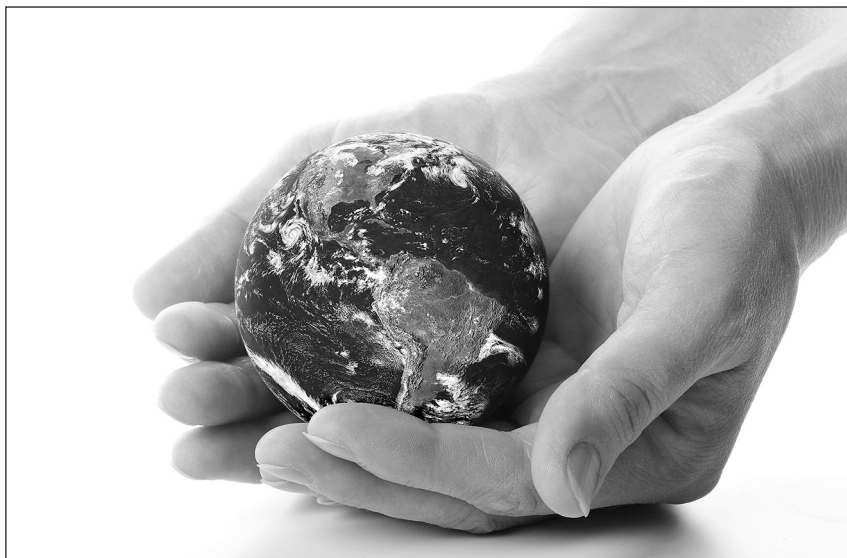
Closing slide of the speaker's presentation