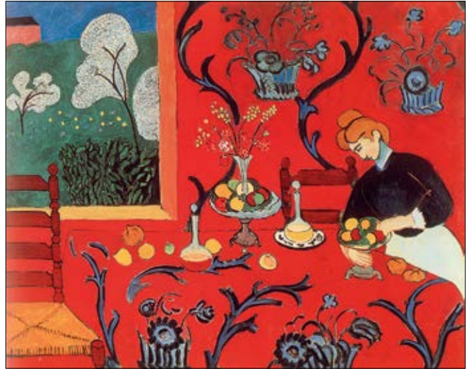
180 × 220 cm