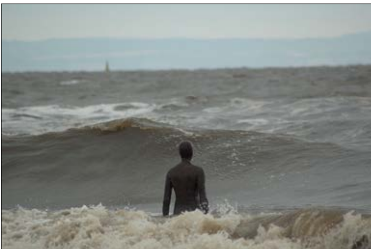
1. Antony Gormley (b. England), Another Place , installation consisting of 100 cast iron life-size figures set into the beach and foreshore of Crosby Beach, Sefton, England, 1997