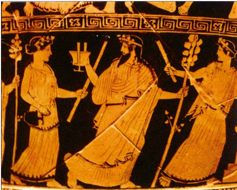
Stimulus image 4: Dionysus, the Greek god of wine and parties