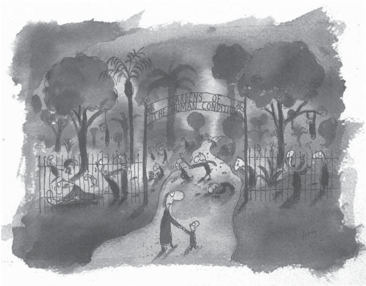
Stimulus image 1: Gardens of the Human Condition , Michael Leunig, 1991

These stimulus images are provided to the production team during the Production development stage for the interpretation of The Birds .