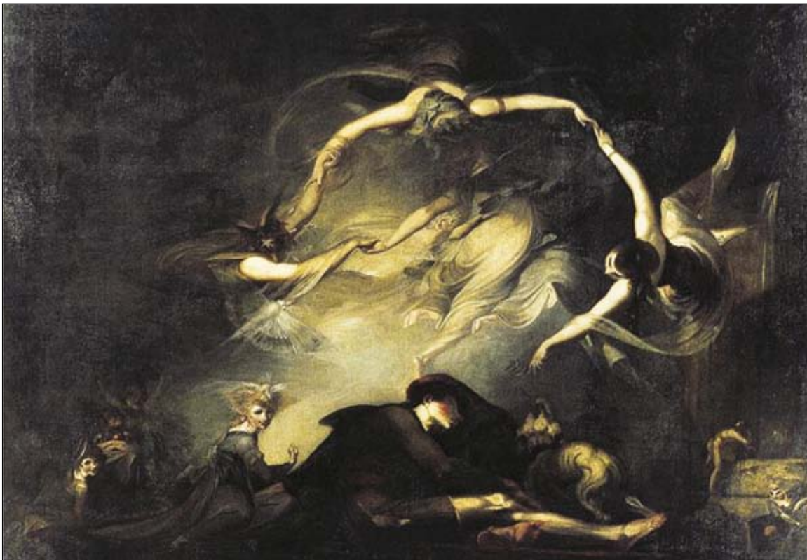
Stimulus Image 2: Henry Fuseli, The Shepherd's Dream , oil on canvas, 1793, 1543 mm × 2153 mm (Tate Britain)