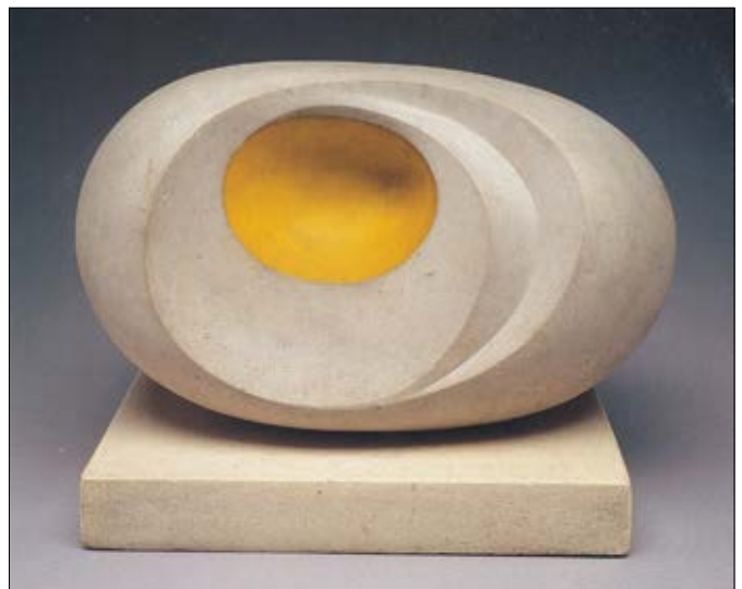
43.8 × 50.7 × 28.2 cm (overall)