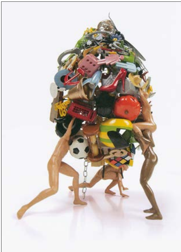
15 × 27 cm