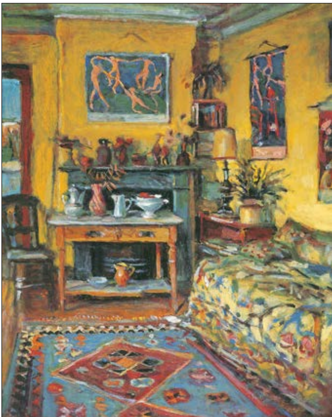
76 × 61 cm