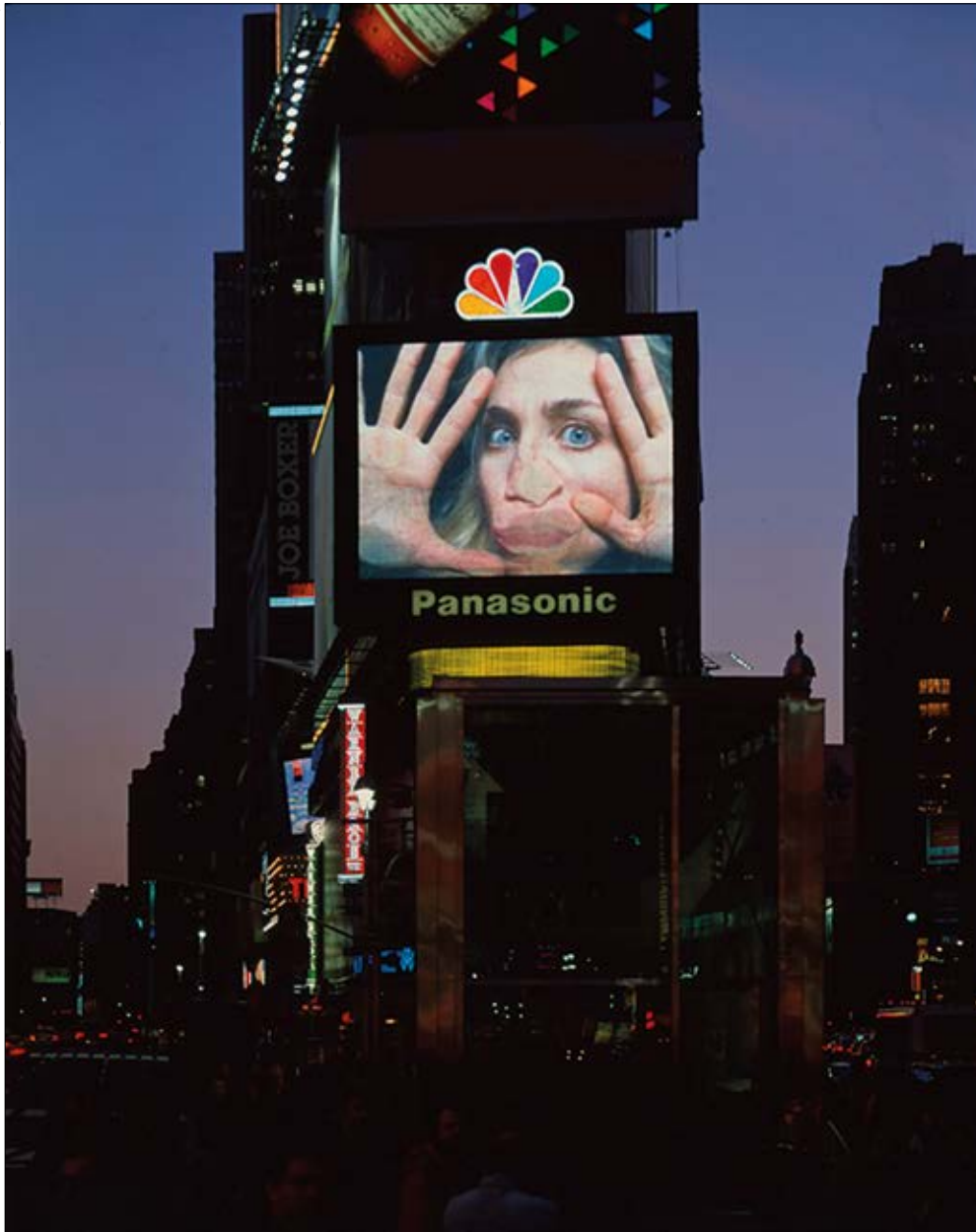
Pipilotti Rist, Open My Glade (Flatten) , video installation, 16 one-minute video segments that interrupted the normal television programs every hour from 9.15 am to 12.15 am, from 6 April to 20 May 2000, on the Panasonic screen, Times Square, New York; © Pipilotti Rist; courtesy of the artist, Hauser & Wirth and Luhring Augustine