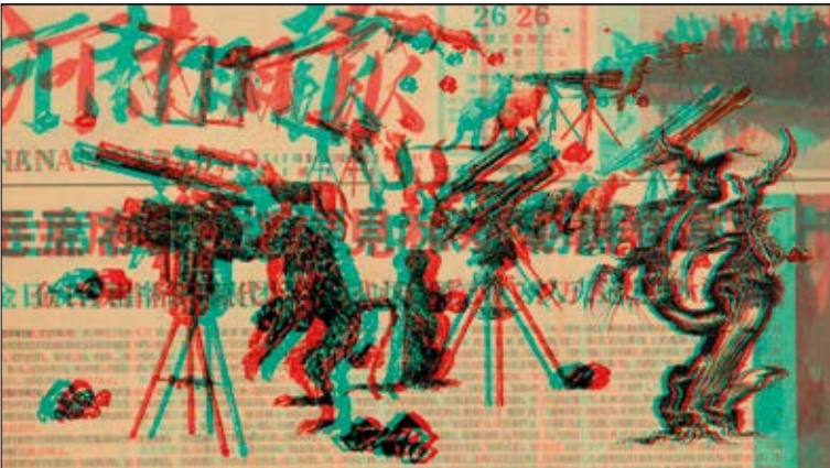
Sun Xun, Time Spy (still), single-channel woodcut animation video, 3D, sound, 2016