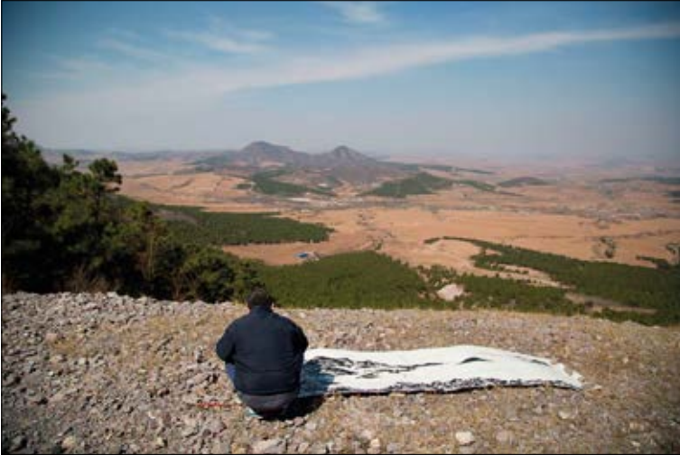
Sun Xun, Mythological Time (photograph of the artist at work), 2016