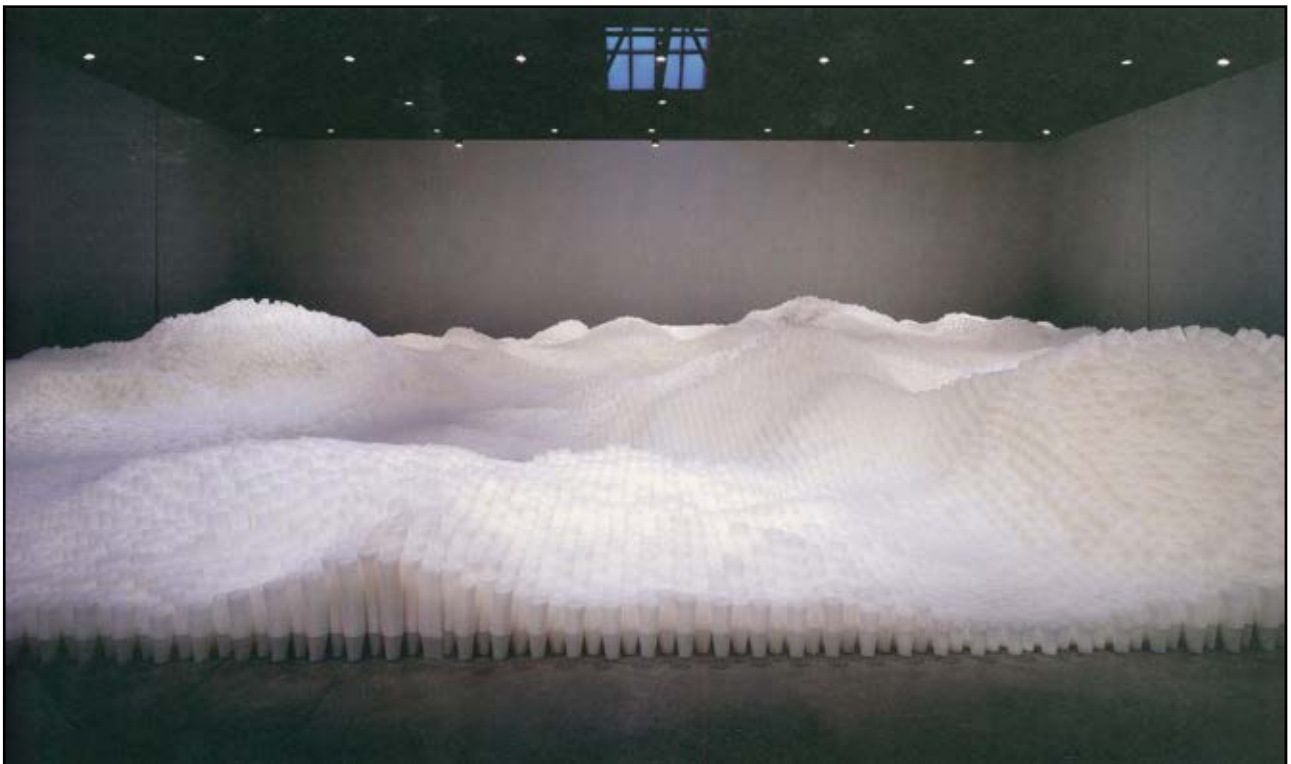
Tara Donovan, Untitled (Plastic Cups) , plastic cups, 2006; courtesy of Pace Gallery and the artist