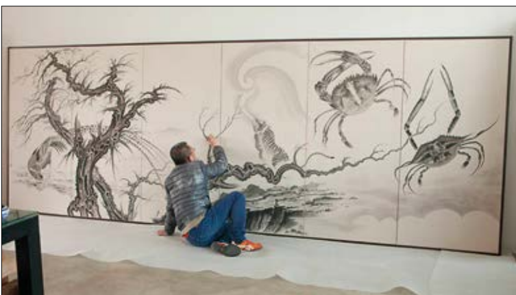
Sun Xun, Invisible Magic (photograph of the artist at work), 2018