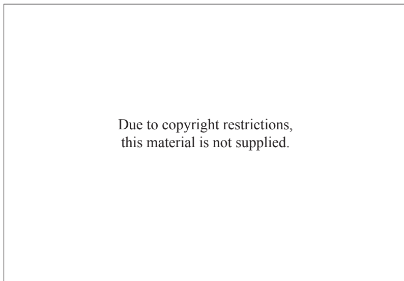
5. Jane Sutherland (b. USA), First Green after the Drought , oil on canvas, c. 1892