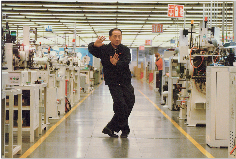
4. Cao Fei (b. China), Whose Utopia? , still from a single-channel video, colour, sound, 20 minutes and 20 seconds' duration, 2006