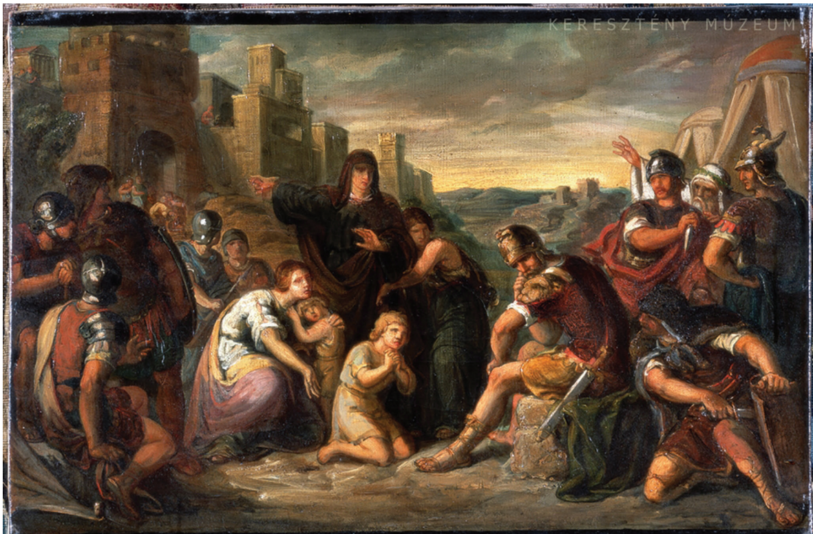
Source: Soma Orlai Petrich, Coriolanus , oil on canvas, 48 × 71 cm, 1869, Keresztény Museum, Hungary

This 19th-century painting, titled Coriolanus , depicts the Roman aristocrat Gnaeus Marcius Coriolanus being confronted by Roman diplomats and priests, as well as his mother, wife and children. They are begging him to end his siege of Rome in 488 BCE.