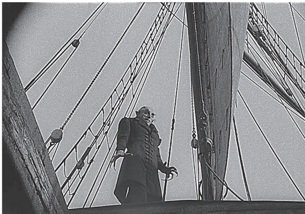
Source: Nosferatu: A Symphony of Horror , film, FW Murnau (dir.), Film Arts Guild, USA, 1922

Describe how one media code conveys meaning in the film still from Nosferatu: A Symphony of Horror (1922) shown above.