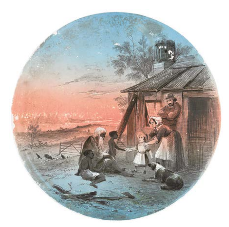
Source: ST Gill, Hut Door , drawing, 22.7 cm (diameter), 185–; National Library of Australia, Rex Nan Kivell Collection, NK6833/B