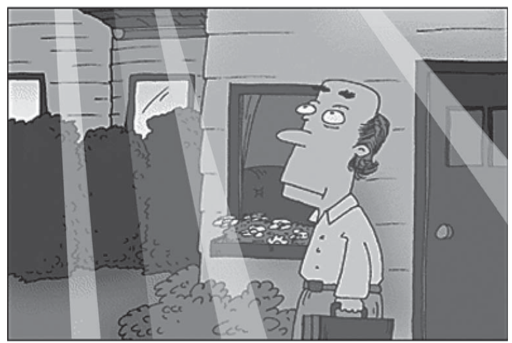
GOOD MORNING ... THIS IS GOD ... I'LL BE HANDLING ALL YOUR PROBLEMS TODAY